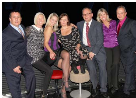
Guests enjoyed the view from the top of The Gherkin!

And at the end of the evening a number of guests went up to the top floor bar and enjoyed spectacular views over London with their drinks.