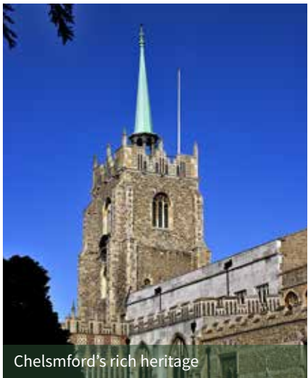
Chelmsford's rich heritage