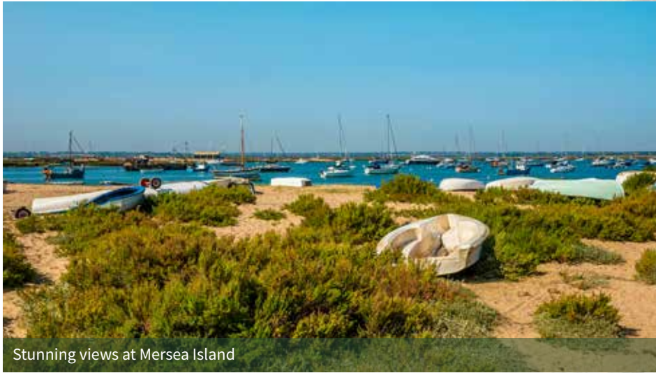
Stunning views at Mersea Island