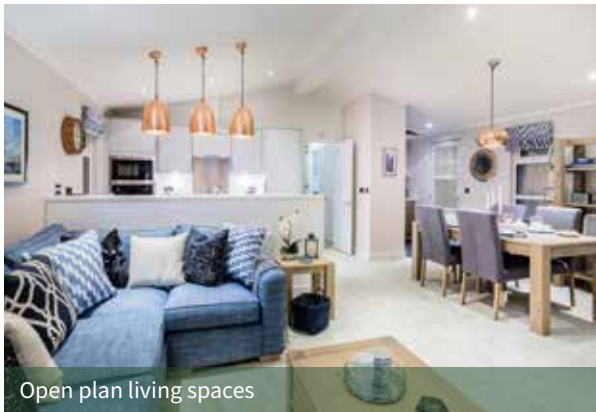
Open plan living spaces