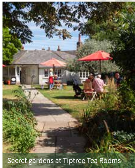
Secret gardens at Tiptree Tea Rooms